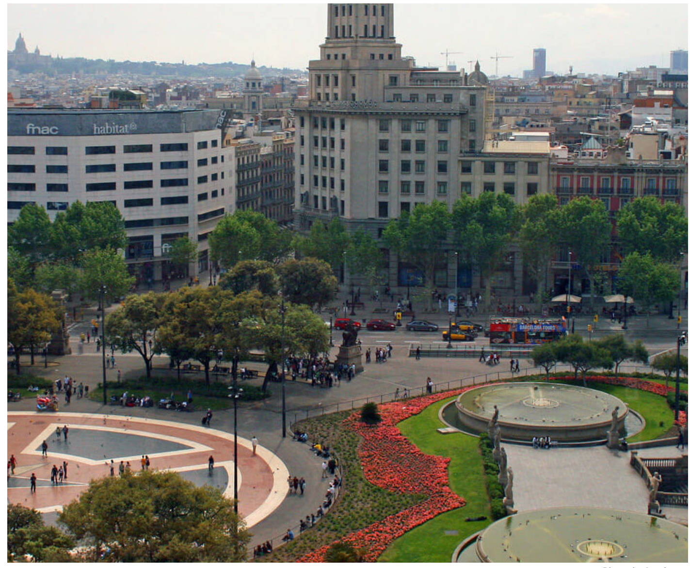
Plaça de Catalunya

Park Güell is located on the northern face of Carmel Hill in Barcelona and is a UNES-CO World Heritage Site. The park was meant to be a housing development, conceived by Eusebi Güell and designed by Antoni Gaudì. This housing development was meant to be a 'garden city' full of terraces and artwork for residents to enjoy. Today it sits as a historic park with hiking trails, mosaics and beautiful views of the city and the sea. This is a great spot to take a morning or afternoon stroll, enjoying the outdoor artwork and unique architectural features and symbols.