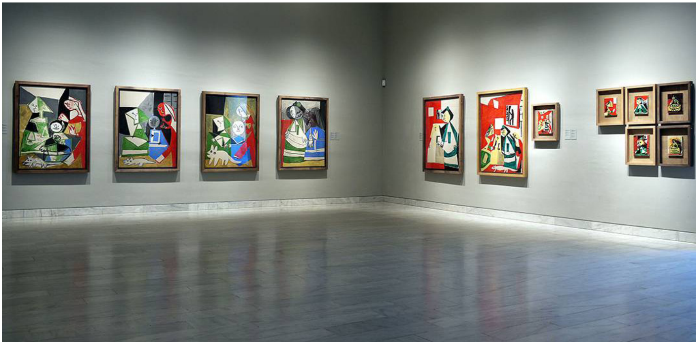
Picasso museum inside