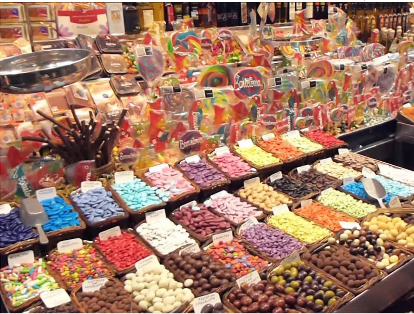
La Boqueria MarketFood