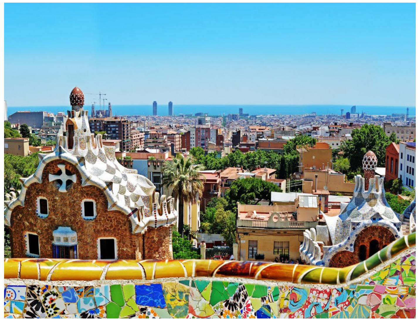
Parc Guell View

I would pack a sweater or a light jacket for the evenings as often the humidity and the breeze coming off the Mediterranean can be a little chilly, especially in the cooler months. If you're visiting in the late fall, winter or early spring, keep the humidity and dampness levels in mind and pack layers of lightweight down. I also suggest packing some light gloves, pants, sweaters and