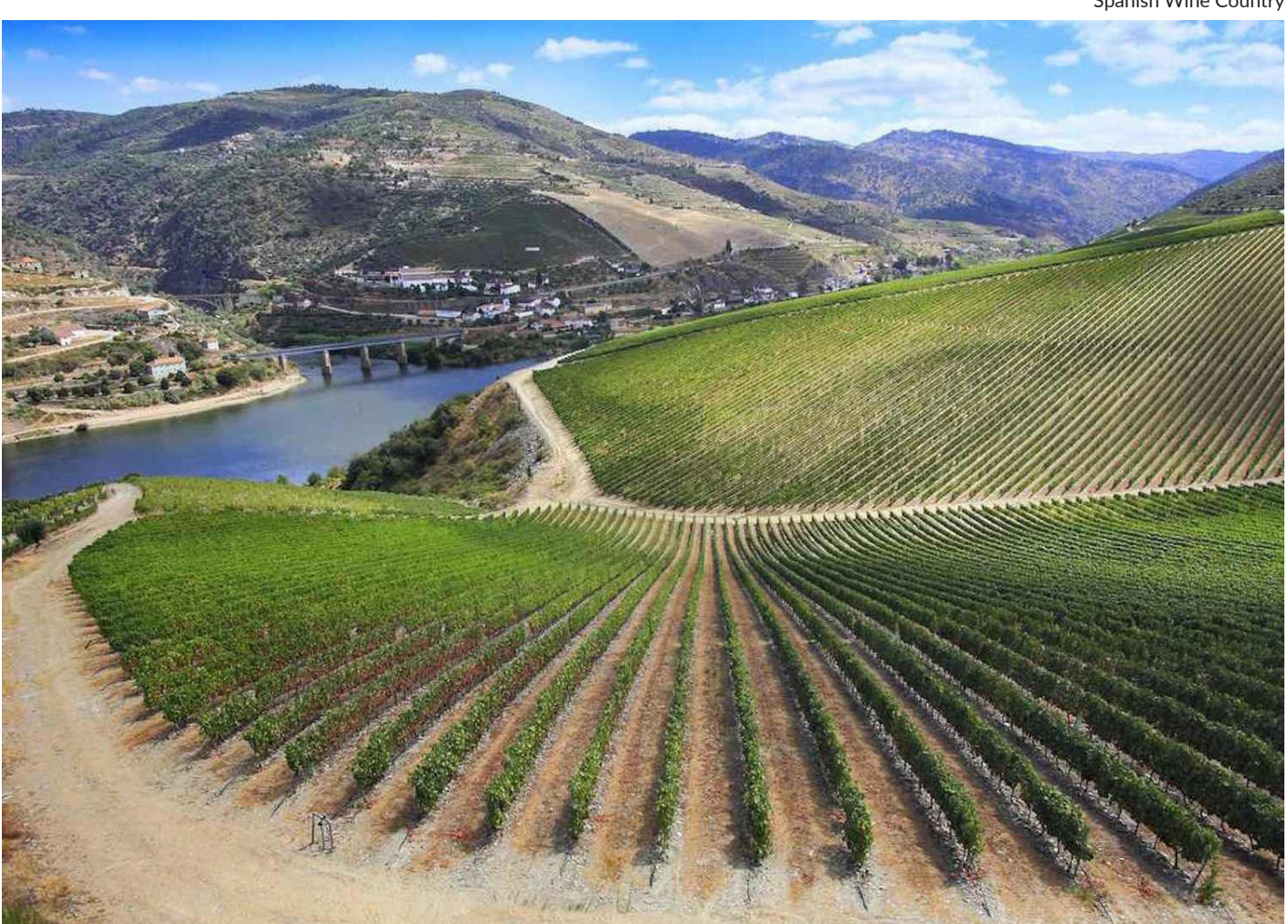
Spanish Wine Country

tranquil retreat to high energy party scene. Cycling the area is also a popular excursion, both around the Barcelona area and its nearby islands, particularly the island of Menorca.